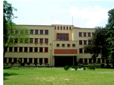
Main Academic Building