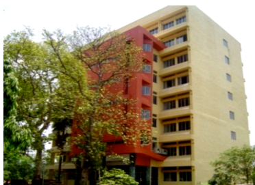
Science and Technology Building

IEST, Shibpur represents a new class of institutes dedicated towards offering post-graduate programs and advanced research, as recommended by the AnandaKrishnan Committee. It has the distinction of becoming the first IEST in the country with promulgation of amendment to the NITSER Act 2014, assented by the Hon'ble President of India from March 4, 2014.