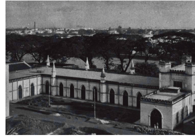
Old Building of Bengal Engineering College (1920)

Bengal Engineering and Science University, Shibpur started its glorious journey in 1856 as Calcutta Civil Engineering College . Developed as the premiere engineering college in pre-independence India, it has been renamed as Bengal Engineering College, Shibpur in 1920. The College has received the status of Deemed University in 1993 and subsequently transformed to Bengal Engineering and Science University, Shibpur in 2004. The then Hon'ble President Dr. A.P.J. Abdul Kalam formally inaugurated this university in 2005.