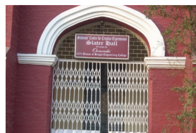
Centre for Creative Expressions