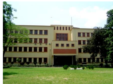
Main Academic Building