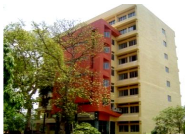
Science and Technology Building

IEST, Shibpur represents a new class of institutes dedicated towards offering post-graduate programs and advanced research. It has the distinction of becoming the first IEST in the country with promulgation of amendment to the NITSER Act 2014, assented by the Hon'ble President of India from March 4, 2014.