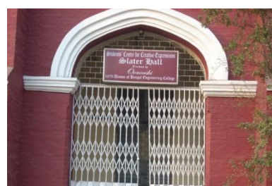
Centre for Creative Expressions