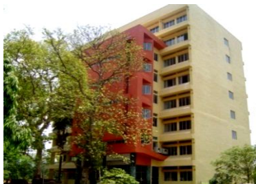
Science and Technology Building

IEST, Shibpur represents a new class of institutes dedicated towards offering post-graduate programs and advanced research, as recommended by the AnandaKrishnan Committee. It has the distinction of becoming the first IEST in the country with promulgation of amendment to the NITSER Act 2014, assented by the Hon'ble President of India from March 4, 2014.