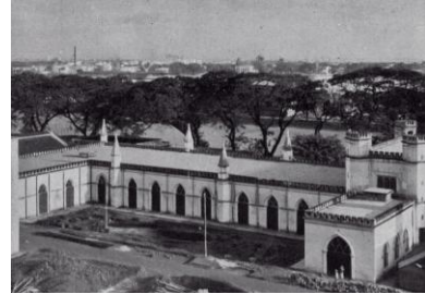
Old Building of Bengal Engineering College (1920)

Bengal Engineering and Science University, Shibpur started its glorious journey in 1856 as Calcutta Civil Engineering College . Developed as the premiere engineering college in pre-independence India, it has been renamed as Bengal Engineering College, Shibpur in 1920. The College has received the status of Deemed University in 1993 and subsequently transformed to Bengal Engineering and Science University, Shibpur in 2004. The then Hon'ble President Dr. A.P.J. Abdul Kalam formally inaugurated this university in 2005.