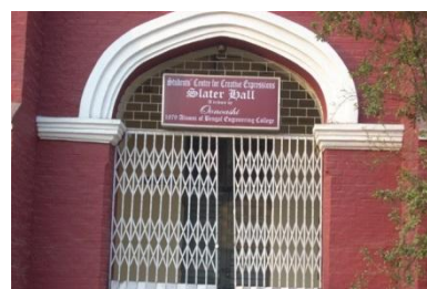
Centre for Creative Expressions