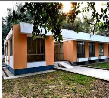
Students' Amenities Centre