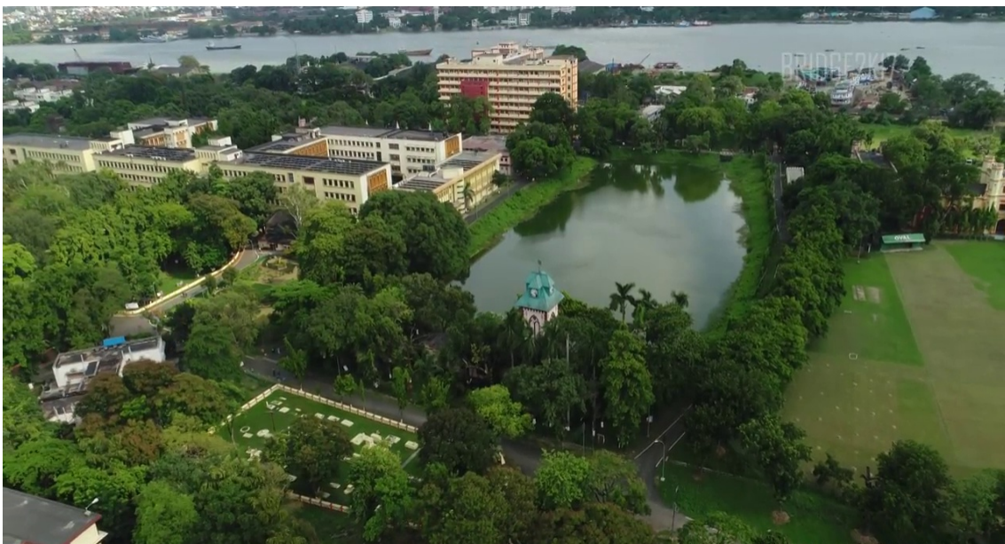
A portion of The Institute Campus

The Institute has a beautiful green campus covering an area of about 49 Hectares with several water bodies situated on the northern bank of the river Hooghly, opposite to the Kolkata Port and next to the Acharya Jagadish Chandra Bose Indian Botanical Garden. The campus accommodates a number of academic and administrative buildings, library, accommodations for staffs and students, guest house, auditorium, swimming pool, students amenities, banks, school, hospitals and general services.