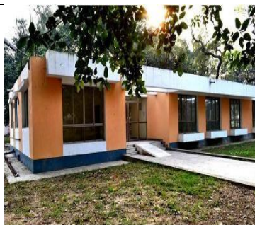
Students' Amenities Centre