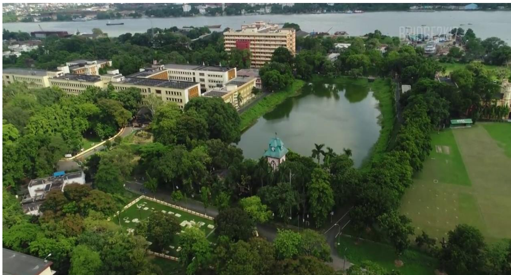
A portion of The Institute Campus

The Institute has a beautiful green campus covering an area of about 49 hectares situated on the northern bank of the river Hooghly, next to the Indian Botanical Garden and opposite to the Kolkata Port. The campus has a number of academic and administrative buildings, library, accommodations for staffs and students, guest house, auditorium, swimming pool, students amenities, banks, school, hospitals and general services.