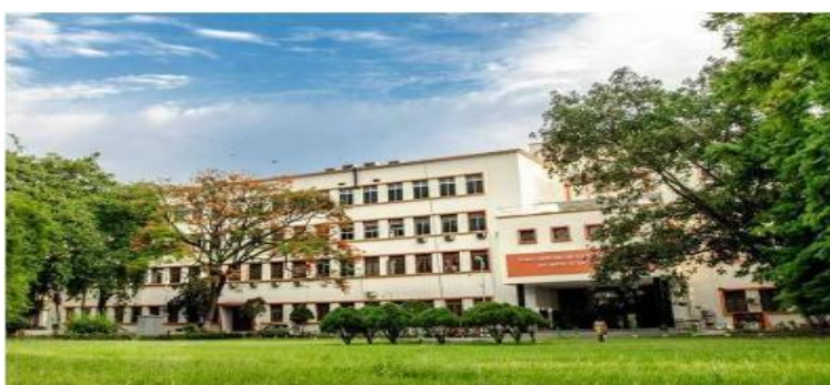
Main Academic Building

The old Workshop complex where the Bengal Engineering College was originally started in this campus is now a heritage building. Part of the workshop is housed in the adjoining building. The workshop complex is quite large, encompassing an area of about 8500 sq. meter.