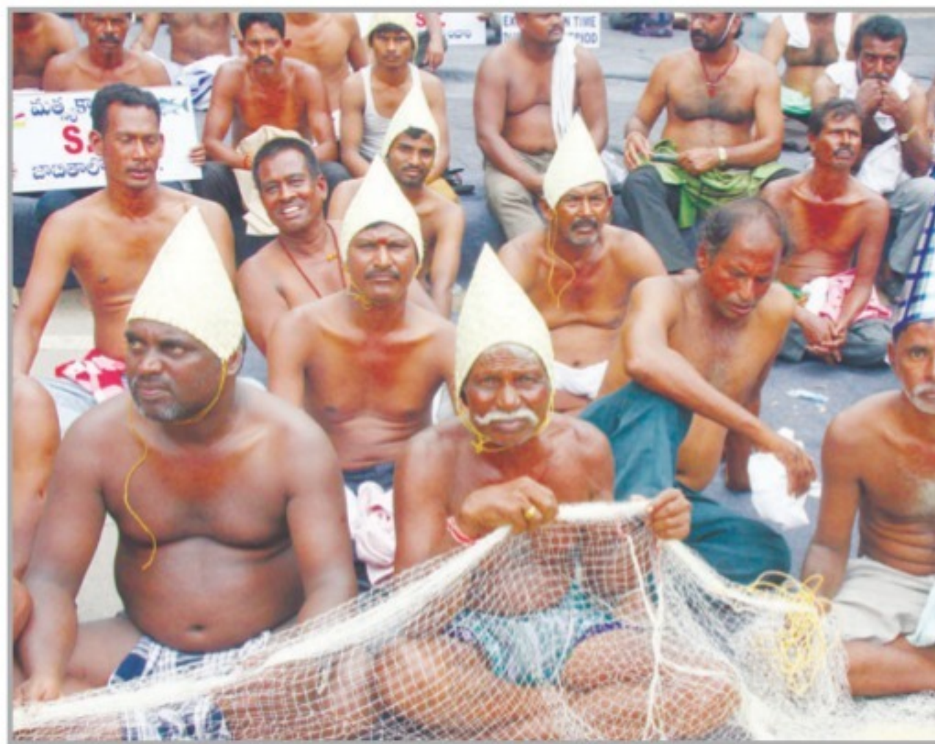
Fishermen from Tamil Nadu and Andhra Pradesh at a protest to demand ST status and other government benefits, at the Jantar Mantar in the Capital on Wednesday.