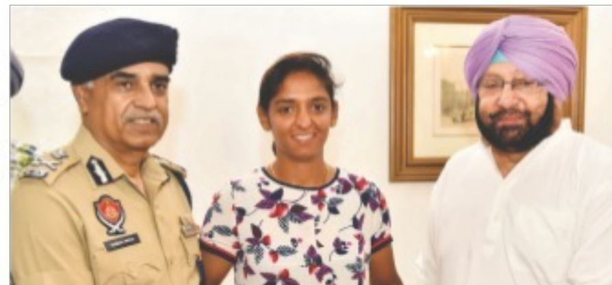
CM Amarinder Singh felicitates Harmanpreet Kaur at his residence in Chandigarh on Wednesday.

CHANDIGARH, 2 AUGUST