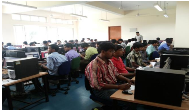
Mock Online Aptitude Test for the 2015 pass-out students prior to Campussing SEASON