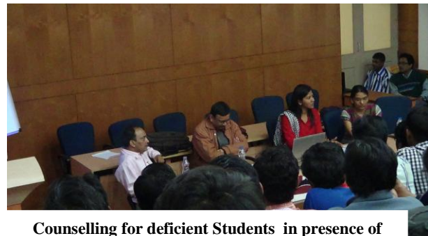
Counselling for deficient Students in presence of faculty members and external experts