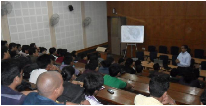
Special Counselling and Remedial Programme for 2015 pass-out batch organised by HRM department during 17.02.14 – 17.04.14 under TEQIP funding