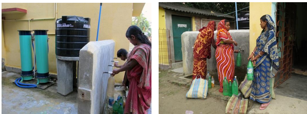
Fig. 6 Use of the Unit by the Community