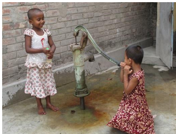
Fig. 2 Arsenic Contaminated Tube Well at Surerkhal Primary School

The community people of the study area are mostly poor farmers and workers. To make them aware about the alarming situation of arsenic contamination in the area, two awareness programs were organized. With audio-visual media, the project team discussed about the health hazards of arsenic contamination, possible technology solutions, and if implemented, involvement of the community in