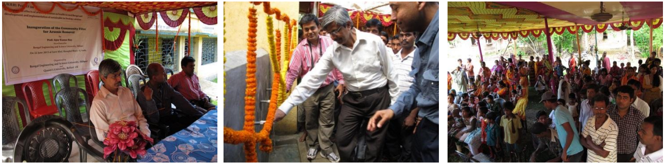
Fig. 5 Inauguration of the Installed Arsenic Removal Unit at Surekhal Primary School

The committee started collecting monthly subscriptions from the families using the filter. They opened a bank account to deposit the collected funds and are maintaining a register of accounts. Daily operation and maintenance of the installed system is done by the member of the Committee.