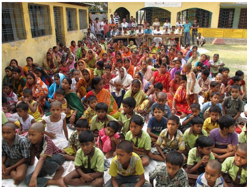
Fig. 3 Awareness Program

maintenance and operation. These programs helped the project team to gain confidence and support of the community people.